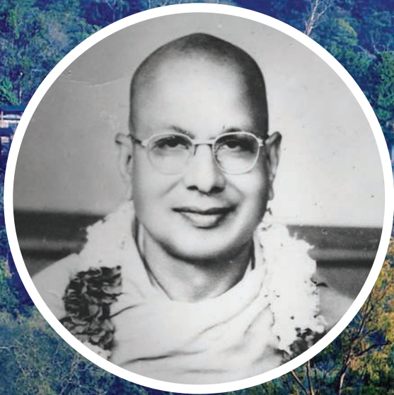
HH PUJYA SWAMI SHUKDEVANAND SARASWATIJI